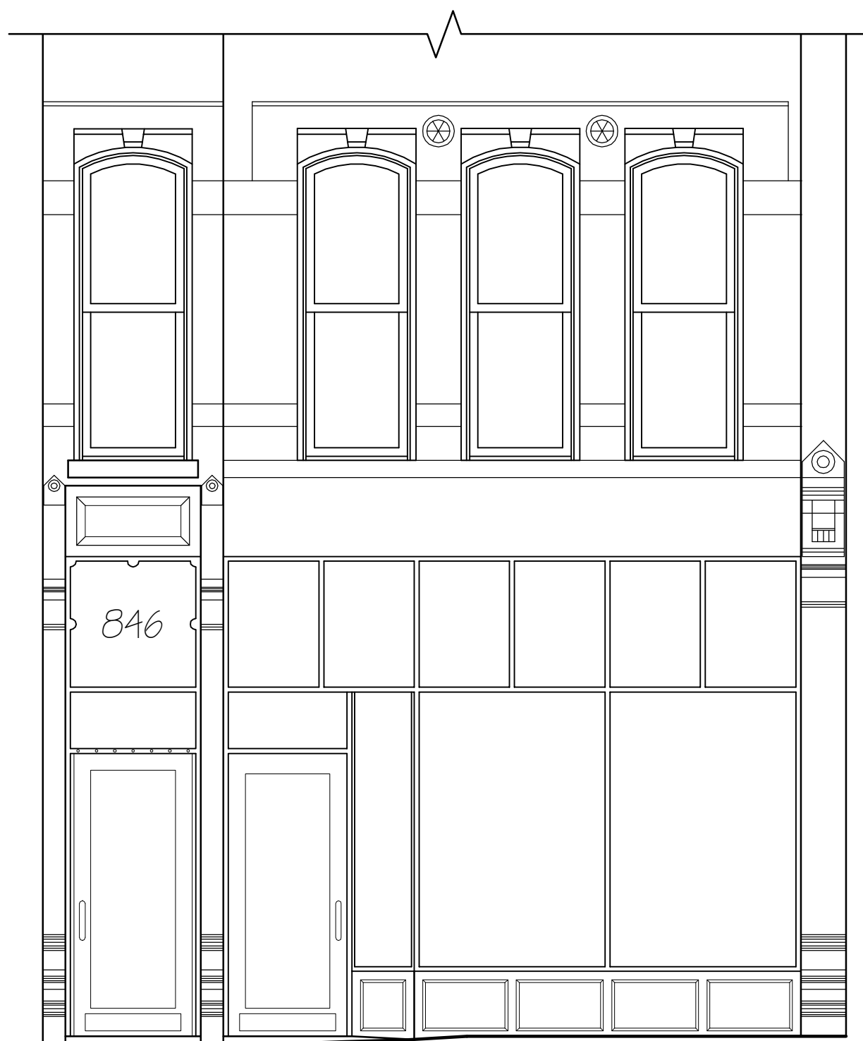
EAST ELEVATION (RETAIL)